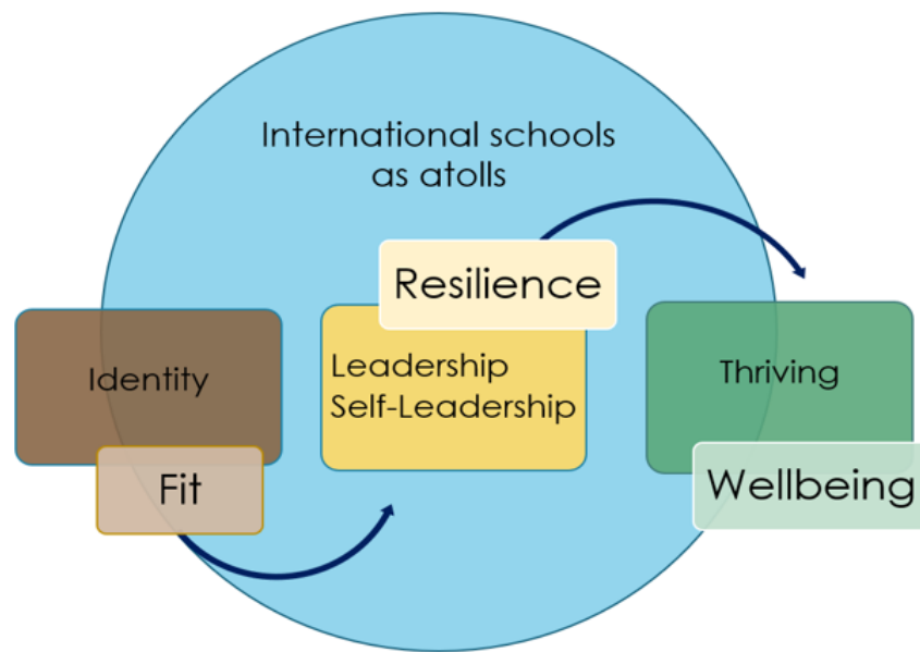
Figure 1. Educator Acculturation Framework (Developed by the author)